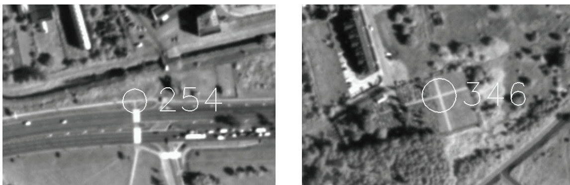
Fig. 1. An example of GCP's on Resurs DK-1 images

The optimal degree of the polynomial for the estimation of the relationship between image and ground coordinates has been investigated. Using 18 GCP's allows calculating 9 polynomial coefficients. Increasing the number of control points up to 24 needed for a better determination of RPC gives the result of geometric correction RMSE X = 0.32 m and RMSE Y = 0.36 m. However, in this case, the necessity of measuring only 8 GCP's disqualifies the method of a terrain related RPC-solution.