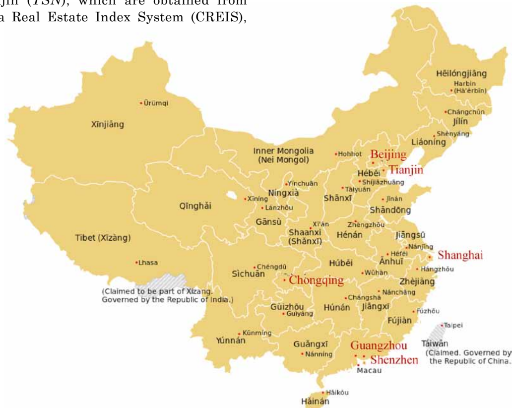
Fig. 1. Provincial map in China (source: http://en.wikipedia.org/wiki/Wikipedia )

as indicators of house prices in different cities 2 . These six cities have the largest population expansion, employment opportunities and economic growth in China and are a magnet for more efficient investment and businesses. For example, the Beijing and Shanghai market play an important role as a price leader and should be watched for policy control, while Shenzhen is the first special economic zone in China, which makes it significantly distinct from other cities. The sample data cover the time period from December 2000 to July 2013 3 . Figure 1 presents the geographical location of the China regions. Chongqing is the seat of the interior area, while the other cities are located in the Eastern region. All price indexes are expressed in natural logarithms and are deflated with a base point of 1,000 in Beijing in December 2000. Figure 2 includes the time-series plots of the six house price indices included in our model and the box plots summarizing the distribution of a set of data. The box plot is composed using few primary elements: the edges of the box are the first and third quartiles; the median and mean is depicted using a line and a symbol in the