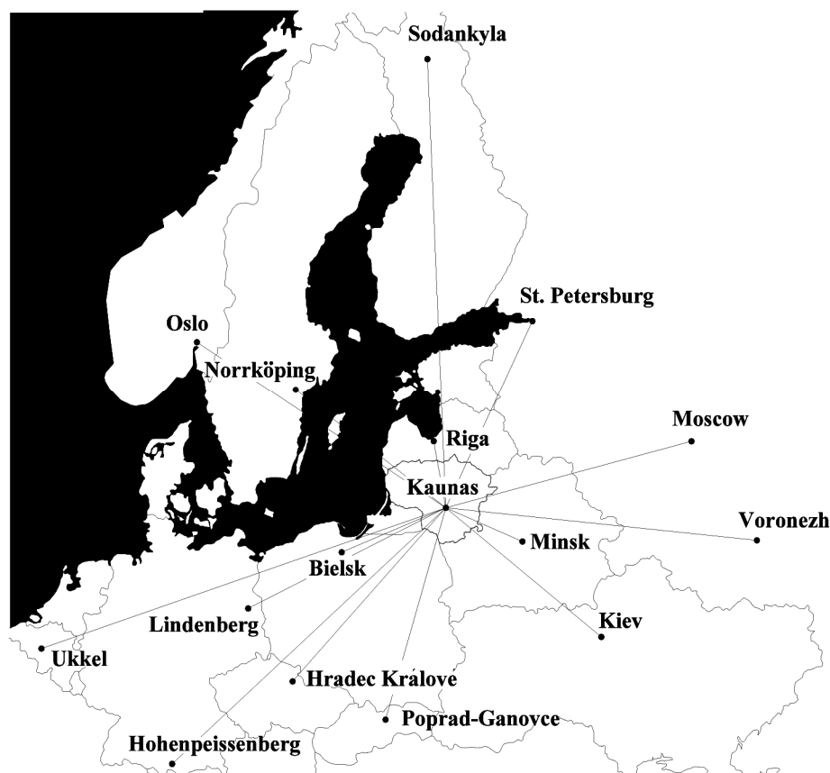
Fig. 1. Scheme of the network of meteorological stations

The distance method was used to measure TOA from ground level (R3-15). The detailed information of TOA was presented by the Lithuania Hydrometeorological Service and the World Ozone and Ultraviolet Radiation Data Centre (WOUDC).