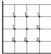
Figure 1. Scheme 1.

Also we assume that there are two differently taken training samples: 1) 4 spatially symmetric observations in training sample for each class; 2) 5 observations in training sample for the first class and 3 for the second one.