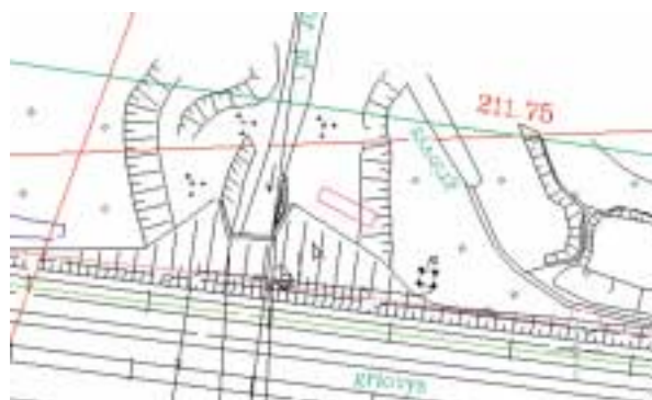
Fig 4. Corrected data base

25 models were renovated in about one week. The plan was obtained in DGN format and transformed to AutoCad DWG or DXF formats for further correction. Changes are corrected by means of photogrammetry and the data of identified points from geodetic sources are introduced to the data base by standard mark. The best was is, if the work is made by the same person, who has done photogrammetric work. Other person could get wrong understanding what was corrected by photogrammetric means. Corrected data are presented in Fig 4.