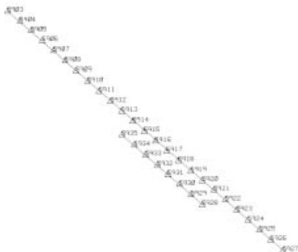
Fig 1. Distribution of aerial photograph centres on the objects' site

It is very important to introduce new elements of railways in an updated plan of the railway strip. Railway elements are seen well in the stereoscopic model. Such elements are shunts, shift mechanisms, signal marks etc. Such marks are drawn in the plan by marks described in specification, if they are identified by a photogrammetric method. Other unknown points marked by red colour are identified in the data base by a geodetic method later (Fig 3).